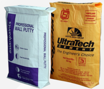
Valve type Bags