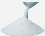
Detergent & Granuals