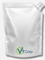
Corner Spouted Pouch